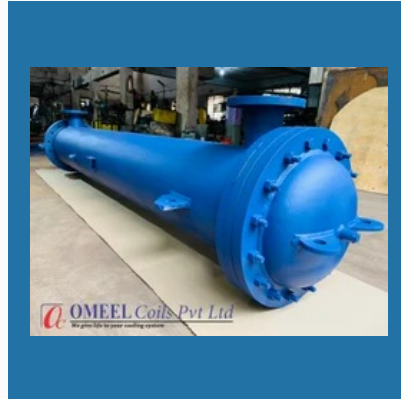
Shell And Tube Type Evaporator