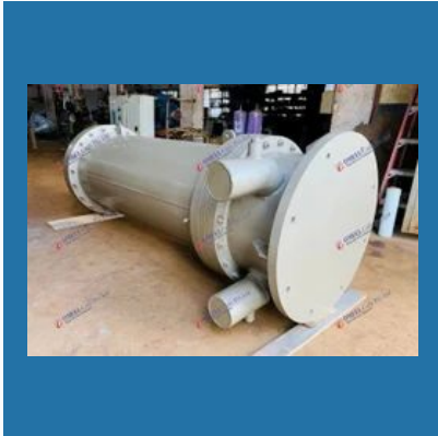
Shell And Tube Water Cooled Condenser