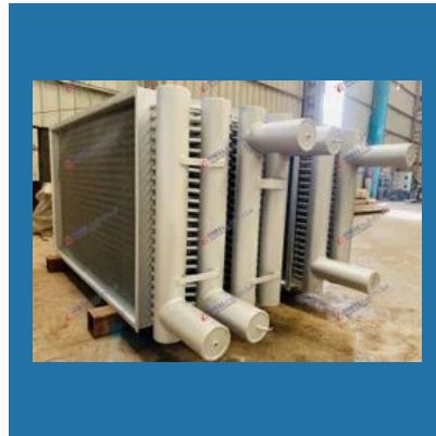
SS Cooling Coil For Air Handling unit