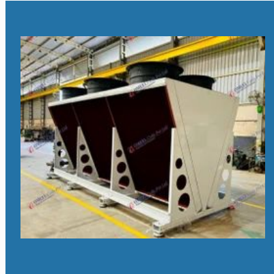
Dry Air Cooled Heat Exchanger