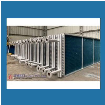
Hydrophilic Coating Coil