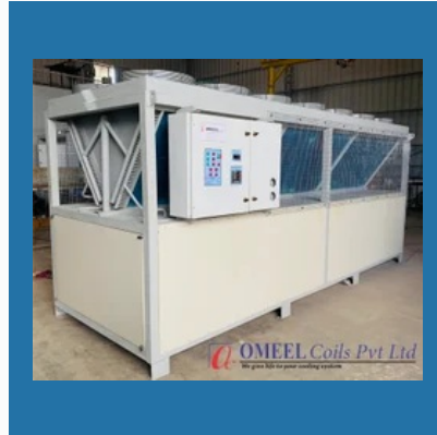
Air Cooled Chilling plant