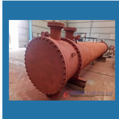
Heat Exchangers For Petrochemical plants