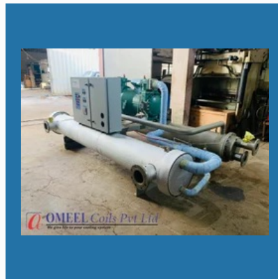
Water Cooled Brine Chiller