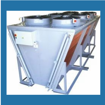
Dry Industrial Air Cooler