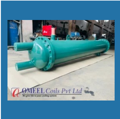
Shell And Tube Water Cooled Condenser