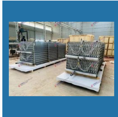
DX Type Fan Coil Unit