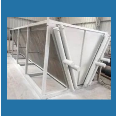
V-Shape Dry Cooler