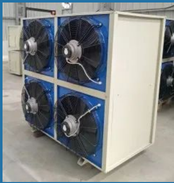
Air Cooled Condensing Unit