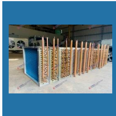
Copper Fins AHU Cooling Coil