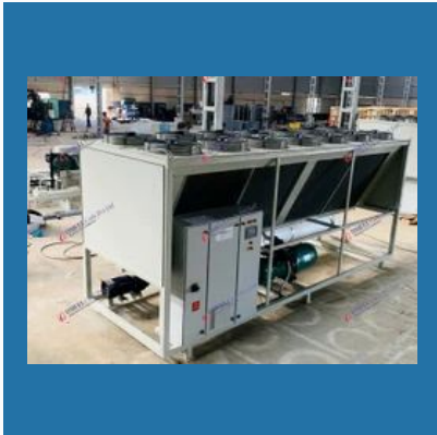
Industrial Oil Cooling Chiller