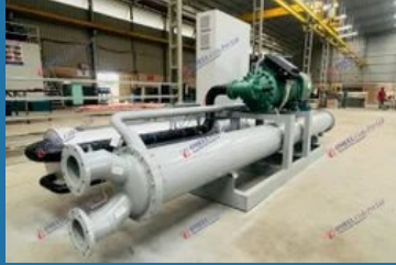
Water Cooled Condensing Chiller