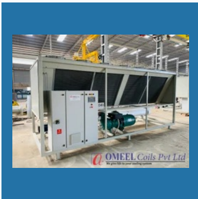
Air Cooled Chilling Plant