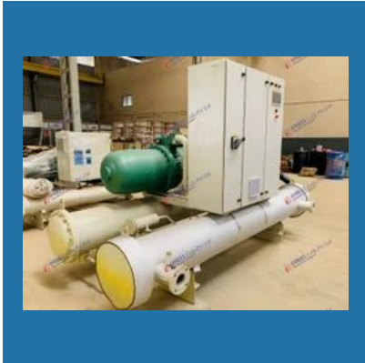
Water Cooled Process Chiller, For Industrial Purpose, capacity 15 TR to 300 TR