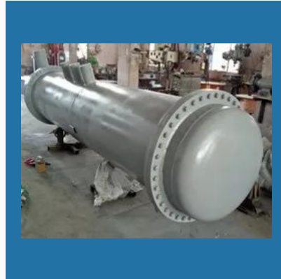
Ammonia Condenser for industrial purpose