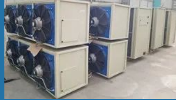
Low Temperature Air Cooled Condensing Units