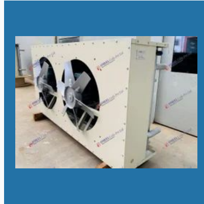
50 TR Dry Cooler