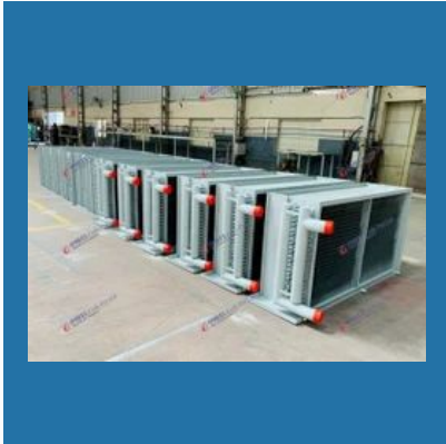
Evaporator Coil For Air handling Unit