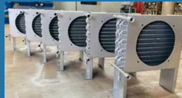
Free Cooling Unit Fcu